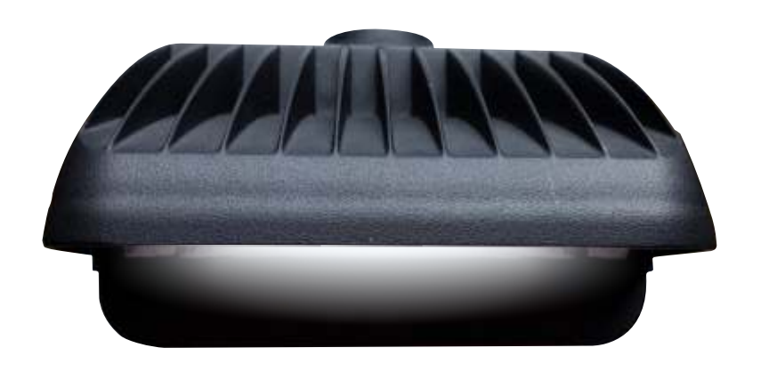
Available in 25W, 40W, 60W, & 80W

The sleek architectural styling of the AWP Series Wallpack is designed to complement the SimplyLEDs FLD-RS Area Light.